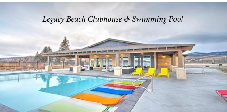
Legacy Beach Clubhouse & Swimming Pool

Swimming Pool Opening Memorial Day May 28th : Pool Hours will be 10:00am - 10:00pm