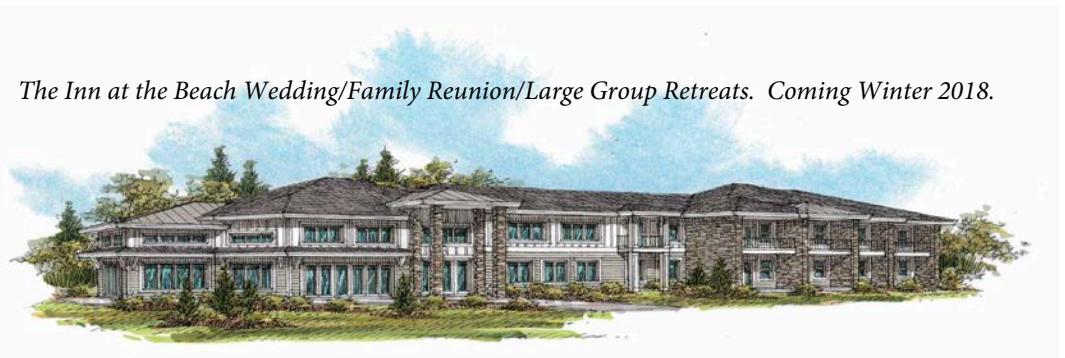
The Inn at the Beach Wedding/Family Reunion/Large Group Retreats. Coming Winter 2018.